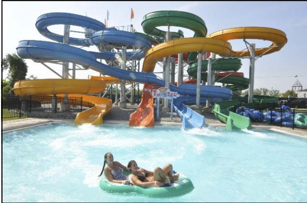
Water Slide at Coney Island Park in Cincinnati, Ohio.