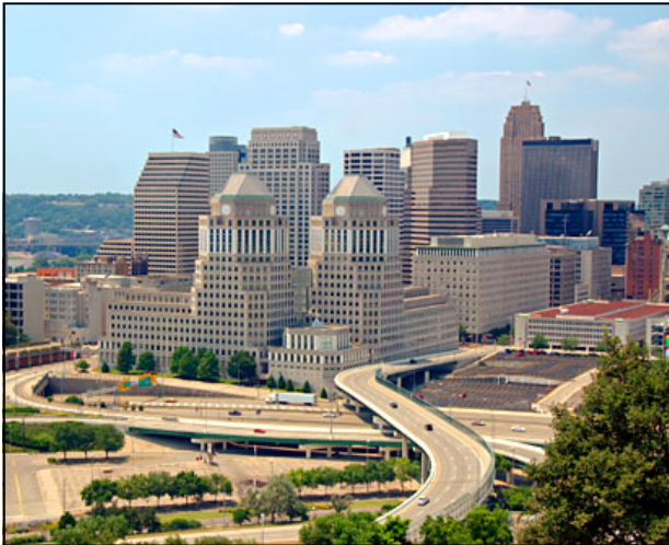
Above: downtown Skyline, Cincinnati, Ohio.