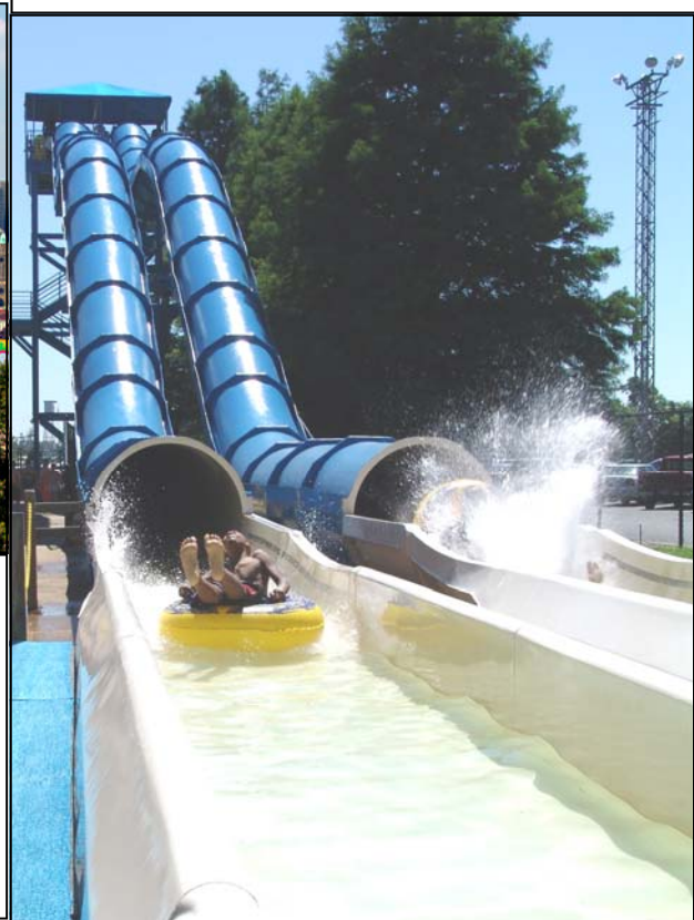
Right: water slide at Coney Island Park, Cincinnati.