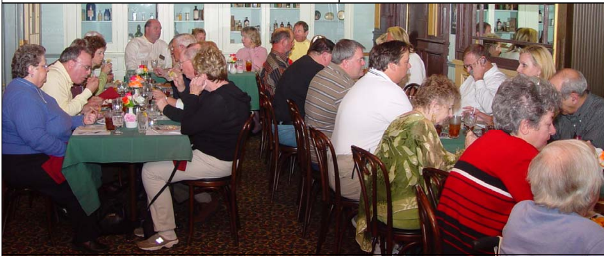
Friday Night meal and get-together, 1st Board meeting.