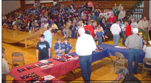
Wilson Evening hosting the Wilson District Cub Scout Pinewood Derby on January 28.