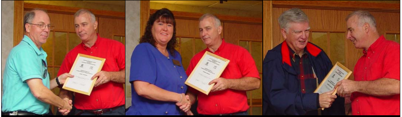
1st Place Zone 6 Lt. Gov. Gary Turner