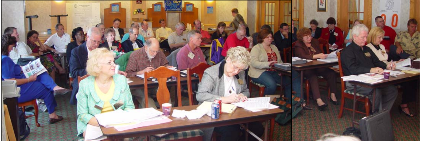
1st Quarter Board meeting in Wilson, November 5, 2005.