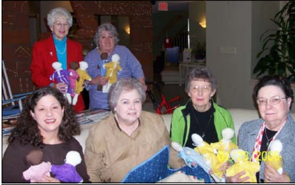
Golden Circle Optimist club during their Annual Ron McDonald visit and program.