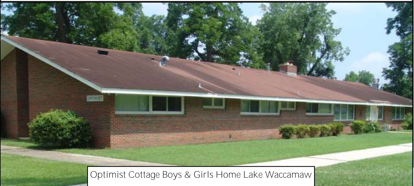
Optimist Cottage Boys & Girls Home Lake Waccamaw