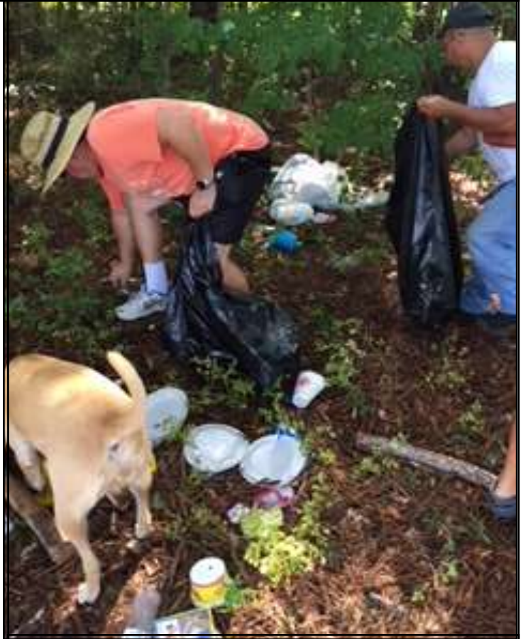
River Rats JOI club guys picking up trash near a cabin we use when we camp out and fish along Fishing Ck in Halifax.

We want to retain our existing JOI clubs during the upcoming year and look to grow by at least 3 during this period. No reason we can't! There's a world of youthful energy just waiting to be har-