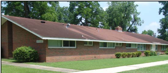
Optimist Cottage B&G Home Lake Waccamaw

For over 50 years Optimists have had a significant impact on the thousands of boys that have come through the Optimist Cottage at Boys and Girls Homes. Thank you for continuing to support that effort today. You are still making a difference for our children!