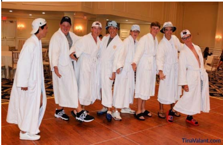
IMPROMPTU TOGA PARTY Boys 14-15 (robes courtesy of Donald Trump sort of)