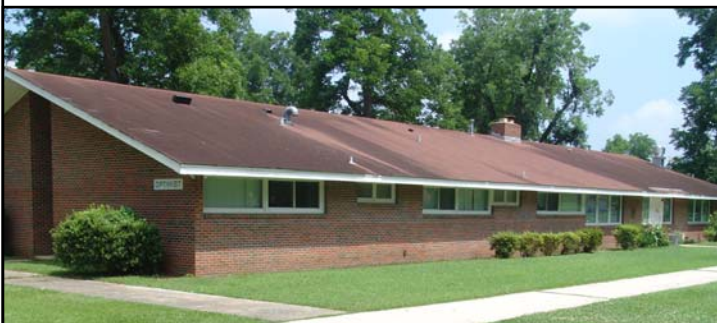
Optimist Cottage B&G Home Lake Waccamaw