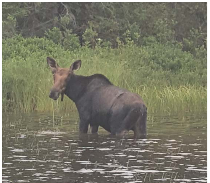
Moose in Kokako, Maine feeding in stream bed.