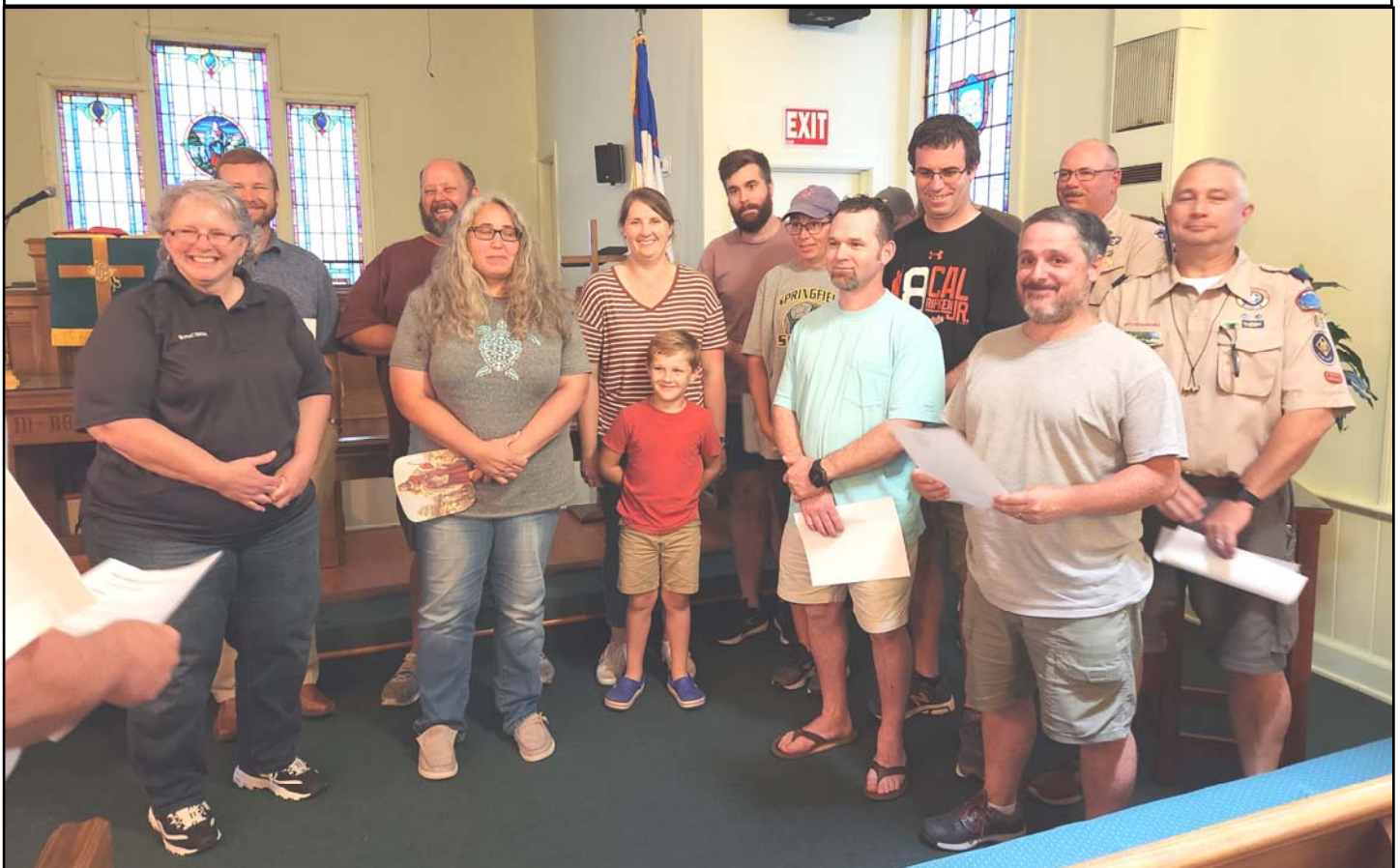
NC East's newest Optimist club, Wilson Scouting Optimist, built by Wilson Evening Optimist