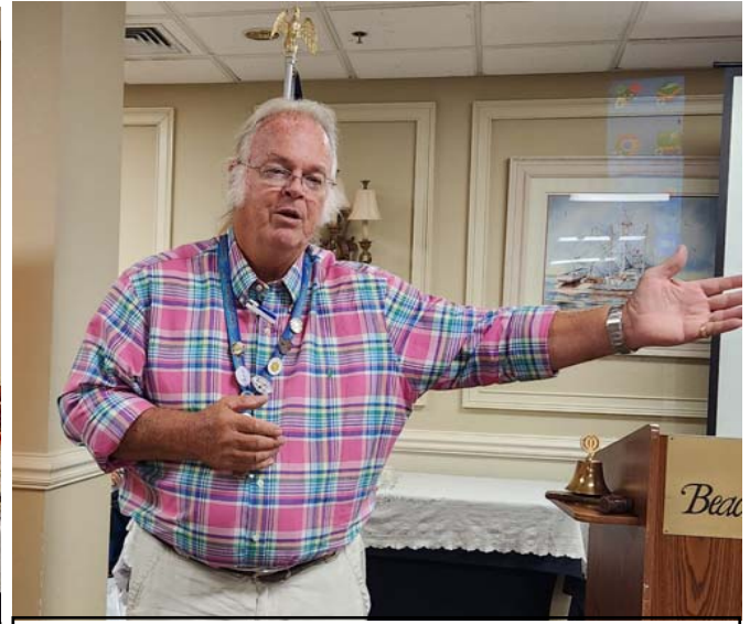
Goldsboro club $365 patch award.