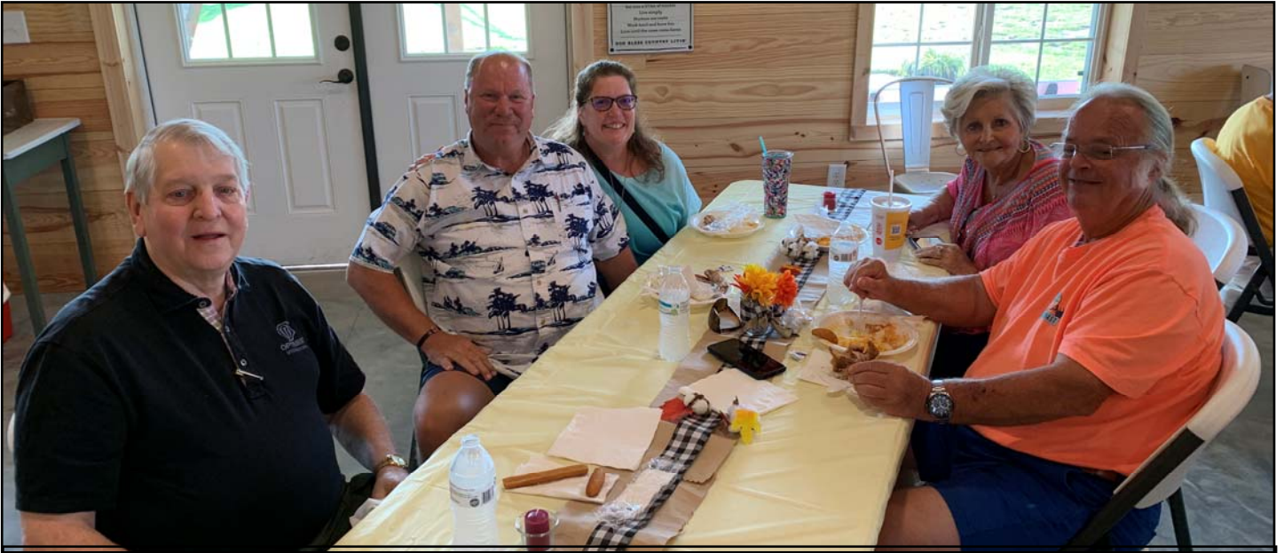
Random photos from quarterly meetin in May