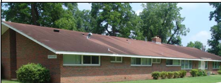
Optimist Cottage B&G Homes Lake Waccamaw