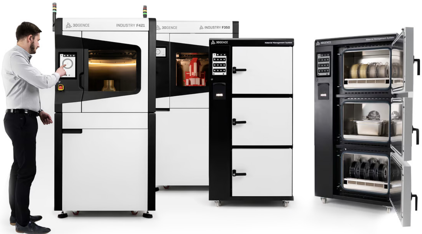
3DGence INDUSTRY F421 | INDUSTRY F350 | (MMS) Materials Management System

Reduce your time-to-market, accelerate your product development, and advance your manufacturing with true industrial grade Additive Manufacturing technology.