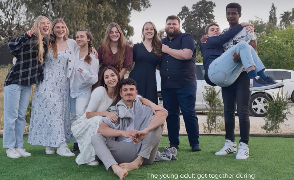
The young adults get together during Passover 2023 that birthed our congregation

I didn't read the rest of the message, I packed up the car and got in the passenger seat. I told my wife, "Drive as fast as you can. Don't stop for anything. I'll shoot at any threat I see." She hit the gas and we flew past bodies, abandoned weapons, empty shells, fire, smoke and more bodies until we reached safety.