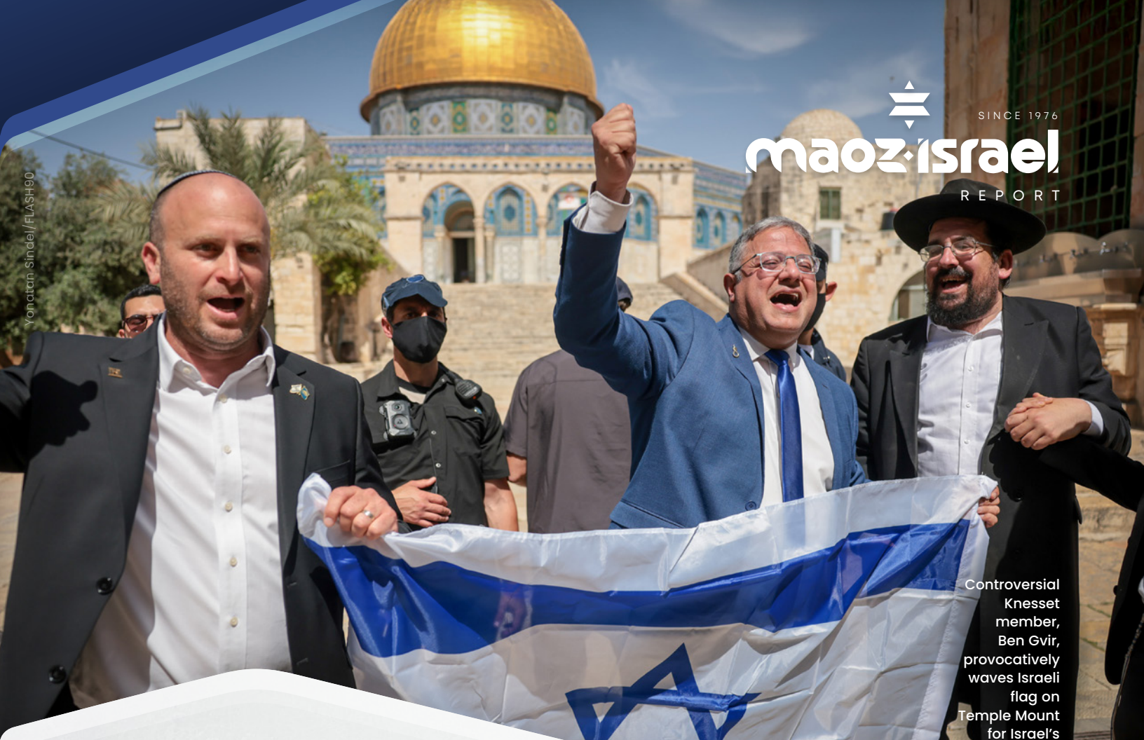
Controversial Knesset member, Ben Gvir, provocatively waves Israeli flag on Temple Mount for Israel's Independence Day