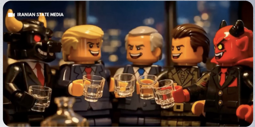
Rights by Section 27A

The New York Post broke a story this month showing how Iran (among other anti-West countries) had been