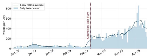
18,246 tweets from 69 Iranian Embassy X accounts; retweets excluded