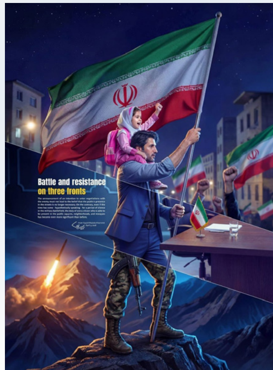
Rights by Section 27A