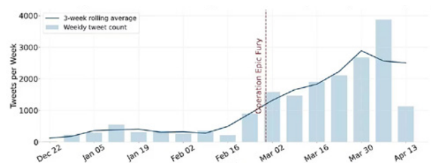
Charts showing spike in posts from official Iranian government accounts since the war began