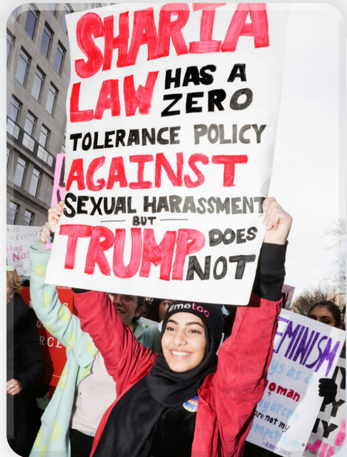
Case in point for Achilles' Heel strategy: Erroneously presenting Sharia Law as pro-women's rights