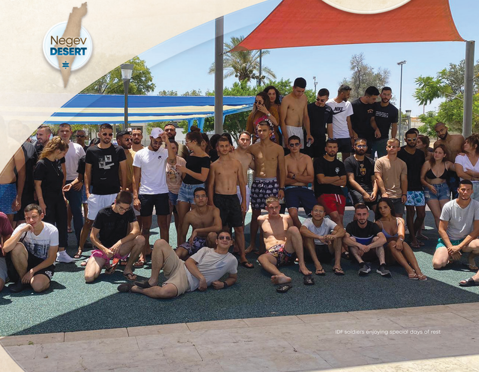
IDF soldiers enjoying special days of rest