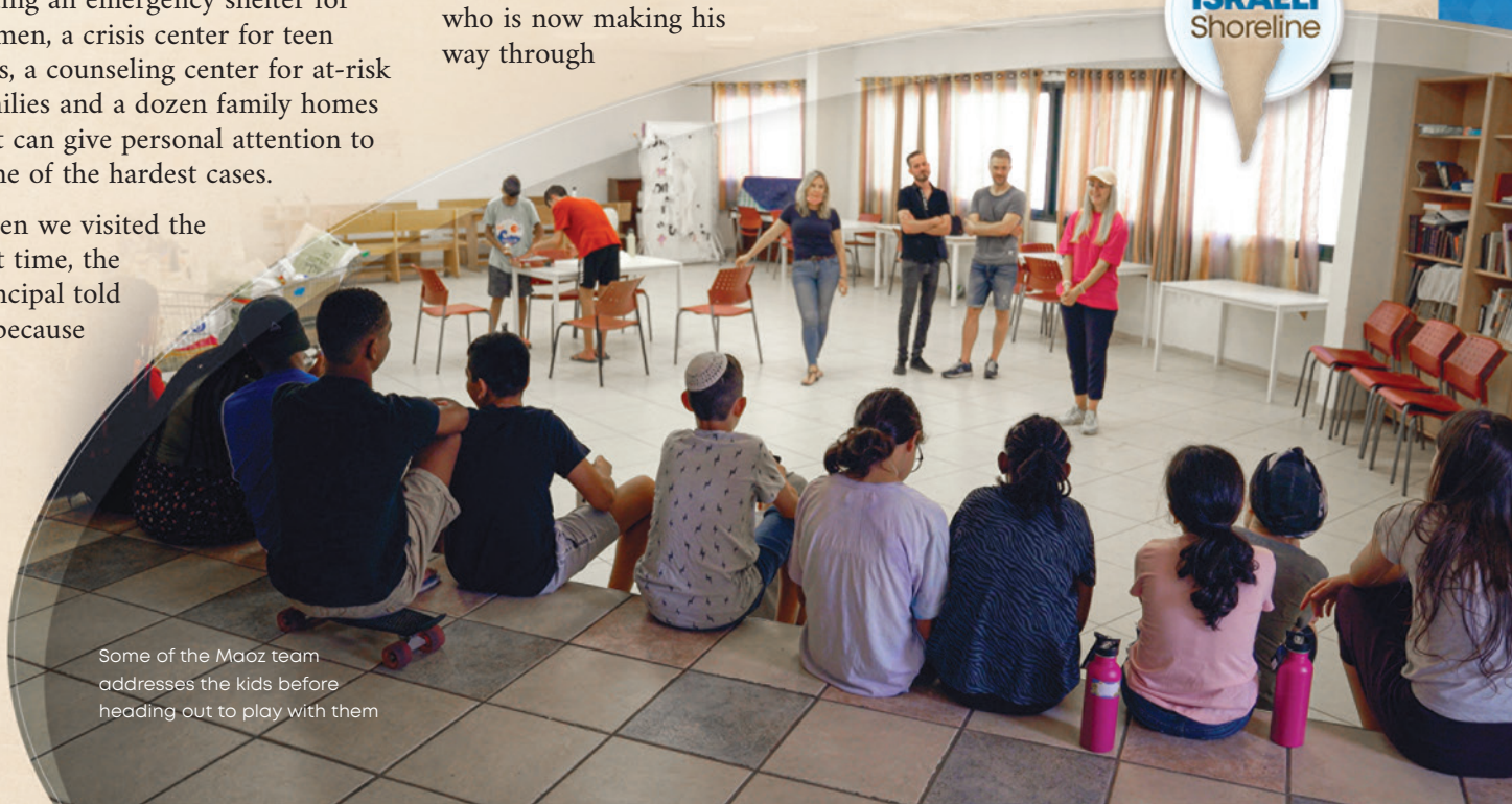
Some of the Maoz team addresses the kids before heading out to play with them