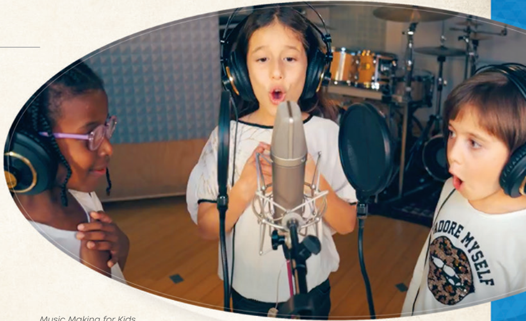
Music Making for Kids filmed this holiday song as part of its program

Raising up an army of worshippers takes time, patience—and a lot of pastoring. But we are raising them up to fight for the Lord. If they aren't trained to use their talents for the Lord, they may waste thier talents on the world. ■