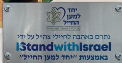
IDF soldiers in the desert enjoying the seating areas I Stand with Israel provided