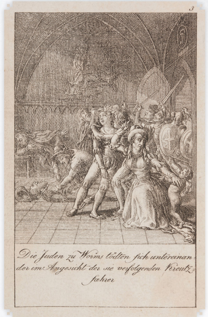
In this historical depiction of the First Christian Crusades, Jews were forced to renounce their faith and kill each other.

Every person on earth, Jew or Gentile, has been invited to have direct access to the Creator... through His son Yeshua (Jesus). Forgiveness of sins, eternal life and a relationship with God are all things you have the ability to enjoy as you embrace the New Covenant.