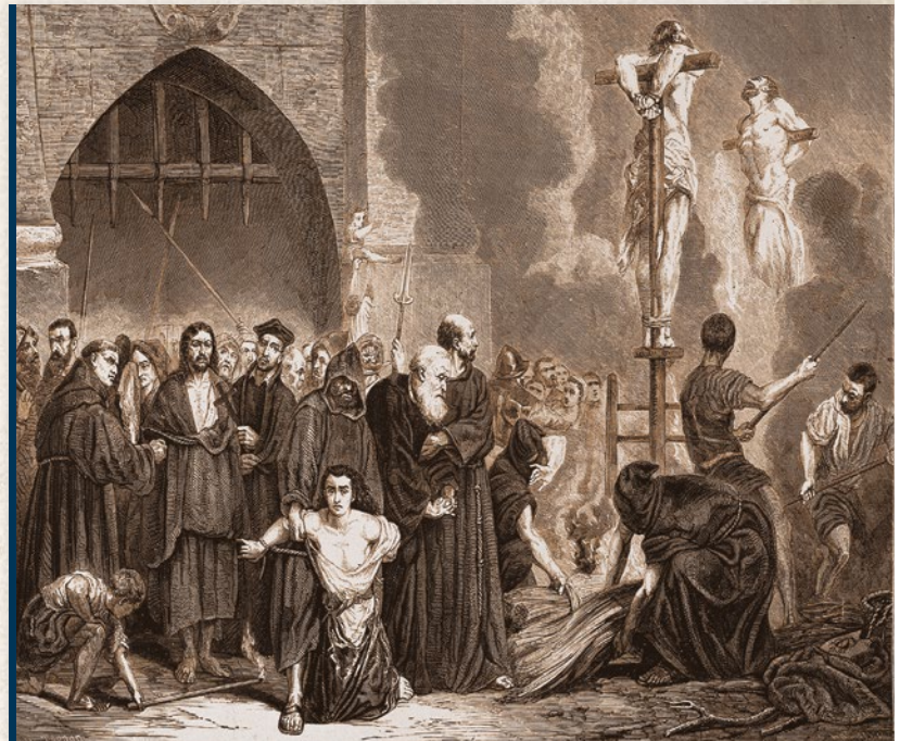
Jews who refused to convert or leave Spain were called heretics and could be burned to death on a stake.

to Portugal but were soon expelled. Others escaped across the sea to South America. According to DNA* tests today, Modern Spaniards and Portuguese have an average 20% Jewish ancestry DNA! In Latin America, the figure is even higher: 23%, where many Marranos fled. This gives a scientific window into the massive number of Spanish Jews who were forced to convert and were absorbed into the Christian population.