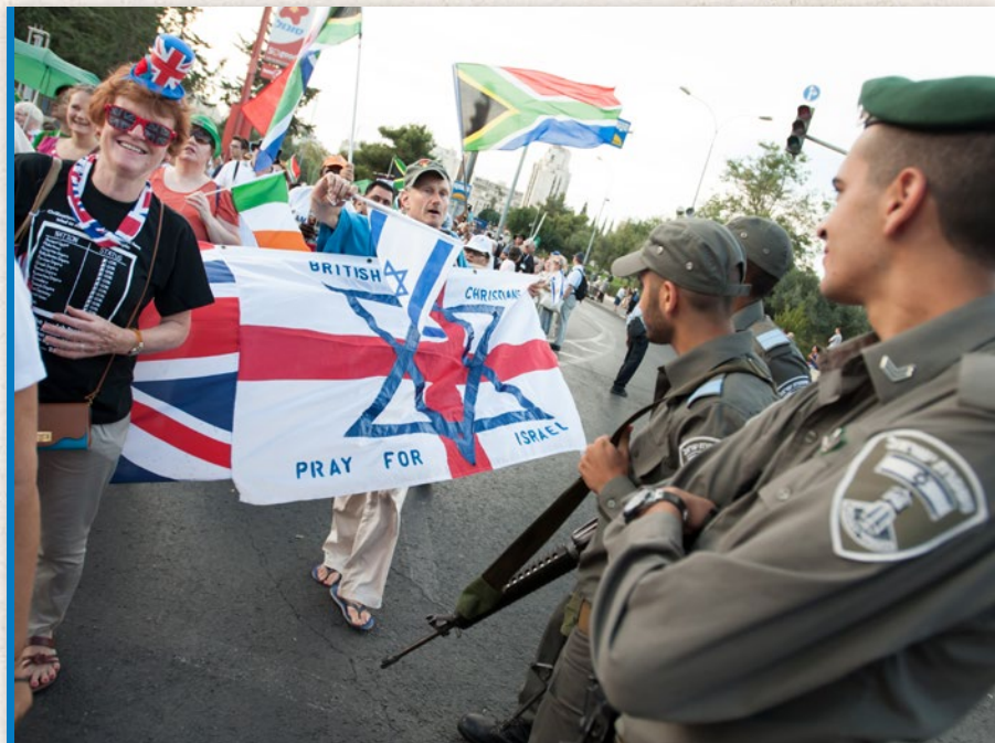
An Evangelical Christian blesses the Israeli border patrol as thousands of Christians from dozens of nations march through Jerusalem in solidarity with Israel.

It's not a complete healing but it is a good first step towards the plan God had from the beginning. ■