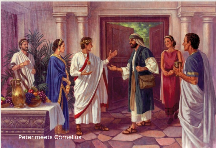
Peter meets Cornelius

Upon arriving at Cornelius’ house, he [Simon Peter] addressed the people there saying, “You are well aware that it is against our law for a Jew to associate with or visit a Gentile. But God has shown me that I should not call anyone impure or unclean. So when I was sent for, I came without raising any objection. May I ask why you sent for me? ” (Acts 10:28-29)