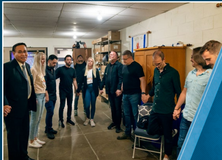
Prayer time in the green room before heading up worship and speak in the evening service