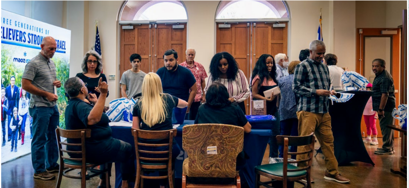
The Maoz Israel Music station: CD's, hats shirts and even necklaces made from Hamas rockets being sold with 100% of profits going to support Israeli worship leaders

People beginning to arrive at registration for the Maoz Generations Conference