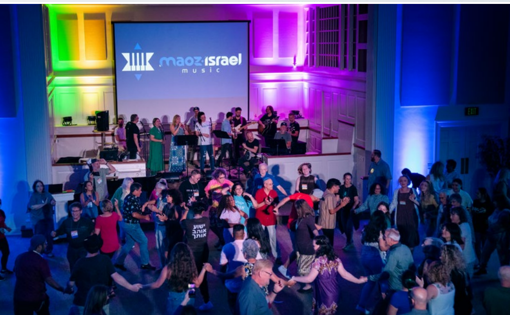
The after-party at the conference included good food, good music and a whole lotta dancing