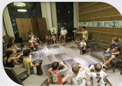
Evacuees take darbukah (Middle East drum) lessons and learn to play together. The lessons are both educational and therapeutic.