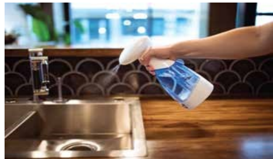
Figure 1. Enozo Technologies, Inc. SB100 Aqueous Ozone Spray Bottle

effects of closer exposure of edge and corner wells to atmospheric conditions.