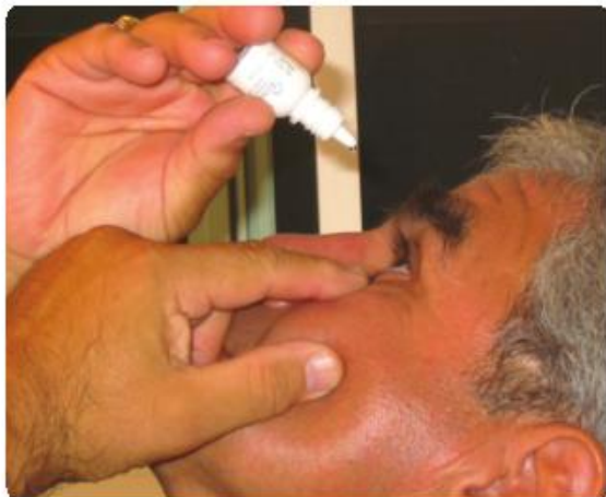
Artificial tears or steroid eye drops may help relieve redness, swelling or dry eye from blepharitis.

Antibiotics. Your ophthalmologist may have you use an antibiotic ointment on your eyes. Put a small amount of ointment on a clean fingertip or a cotton swab (Q-tip). Gently apply the ointment to the base of your eyelashes. Do this just before bedtime, or as your doctor recommends. Your doctor might prescribe an antibiotic medicine for you to take by mouth.