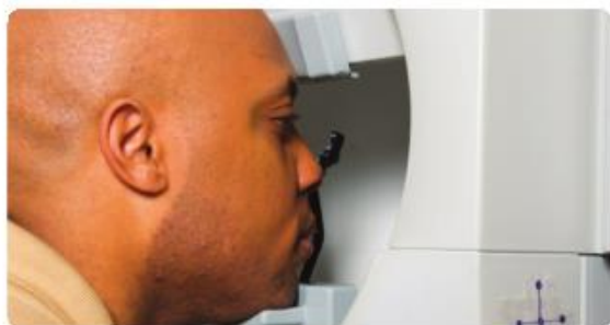
Visual field testing is used to monitor peripheral, or side, vision