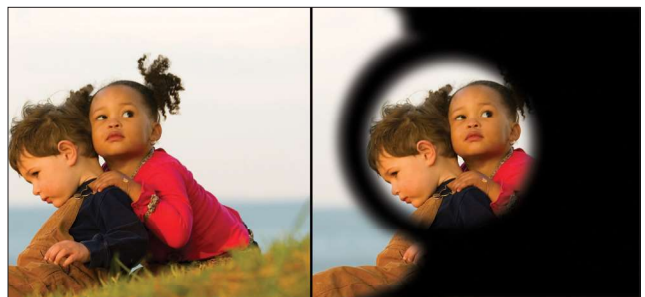
A normal visual field is represented in the image on the left. The image on the right is an example of severely damaged vision.