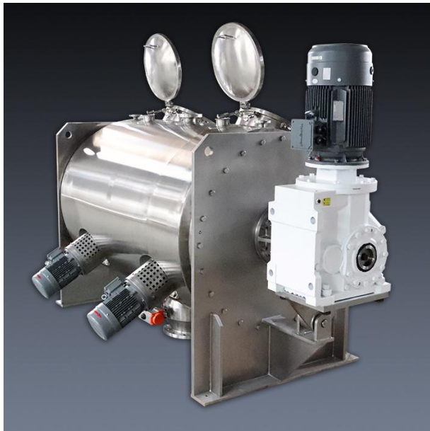
Vacuum Mixer Dryer in All Stainless Steel