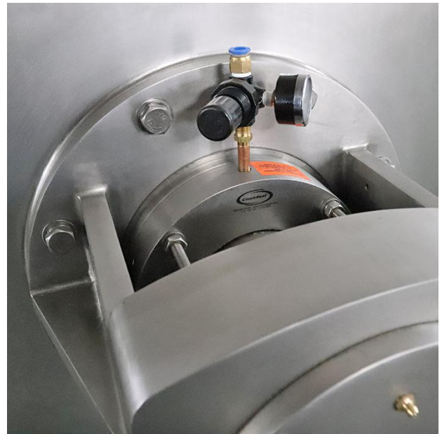
Cinchseal of PTP-D Mixer Dryer