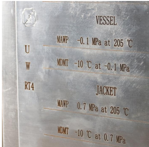
ASME Coded Jacket for Mixer Dryer