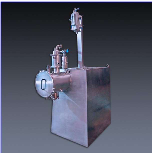
PTPD-45D Pilot Size Mixer Dryer