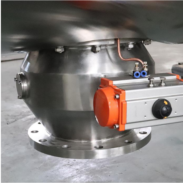
Semi-ball Discharge Valve for Mixer Dryer