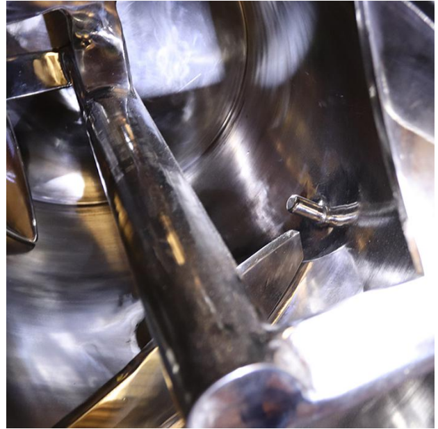
Temperature Probe in Vacuum Mixer Dryer