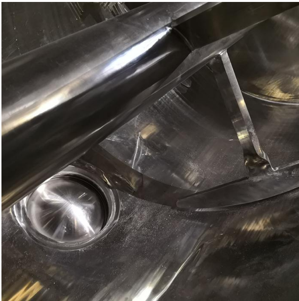
Internal View of PTP-D Mixer Dryer