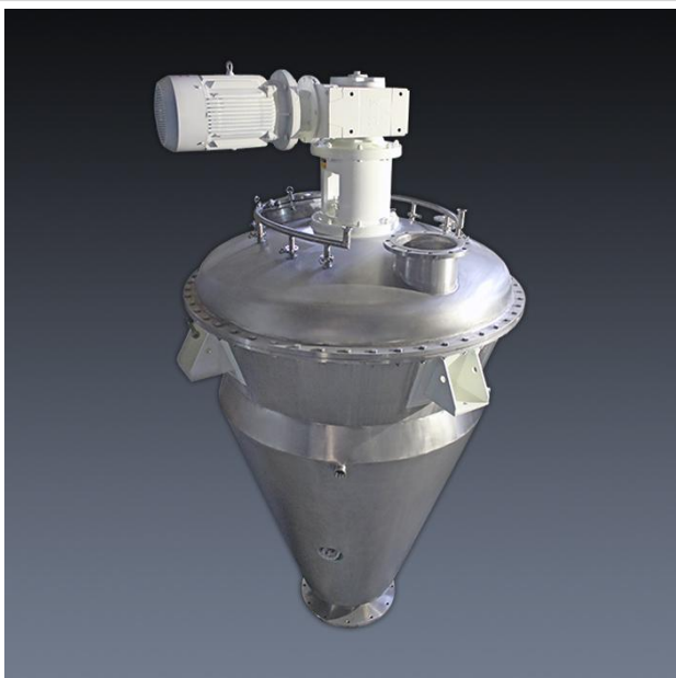
Mixer with Dome Cover for Vacuum Execution