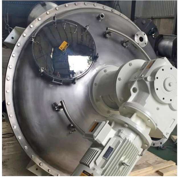
Manway and Liquid Adding Nozzles