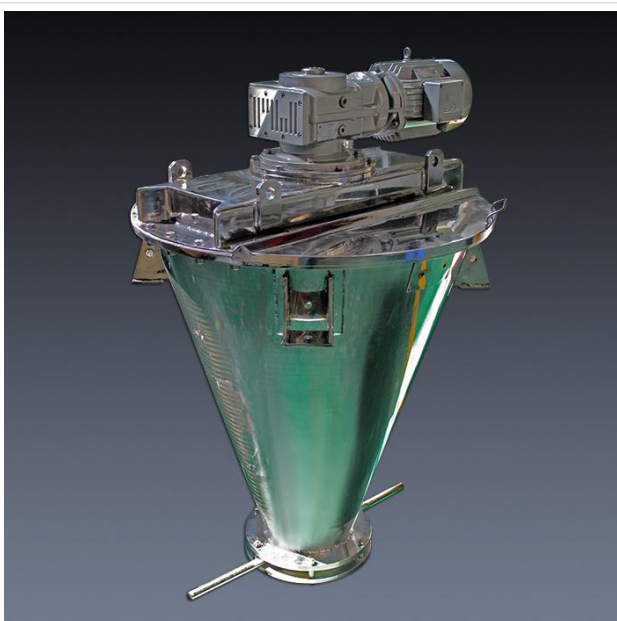
PVR Mixer Built in All Stainless Steel