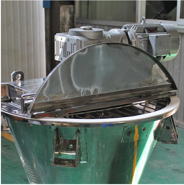
Loading Cover with Safety Mesh of PVR Mixer