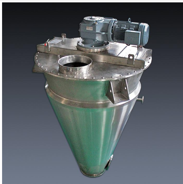
PVR Mixer with Heating Jacket