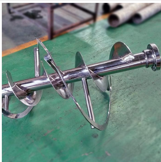
SS Ribbon of PVR Mixer