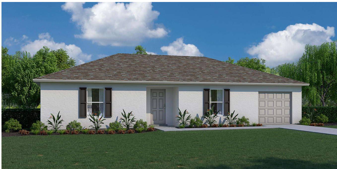
Architectural Style A