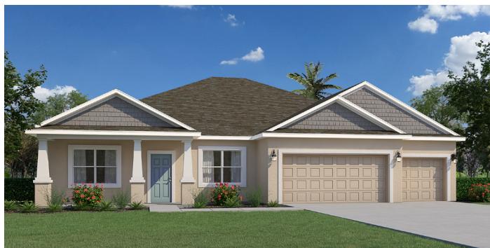
Architectural Style B