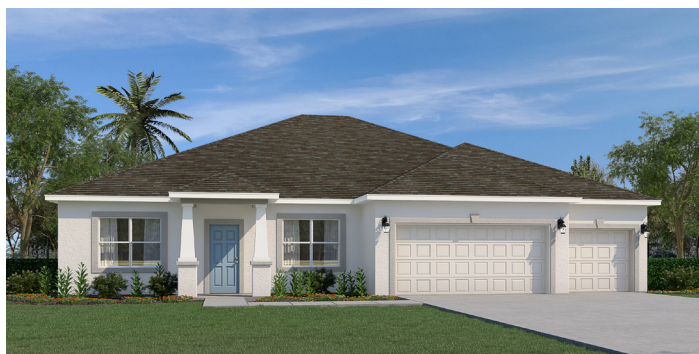
Architectural Style A