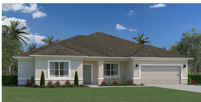
Architectural Style A