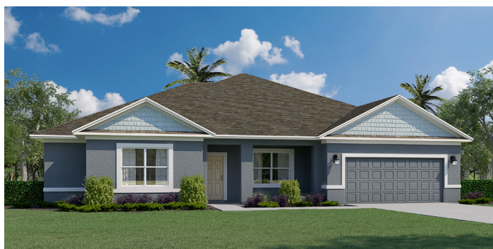
Architectural Style B