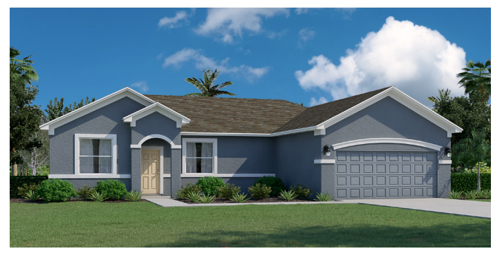
Architectural Style B