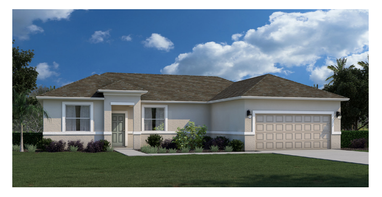
Architectural Style A