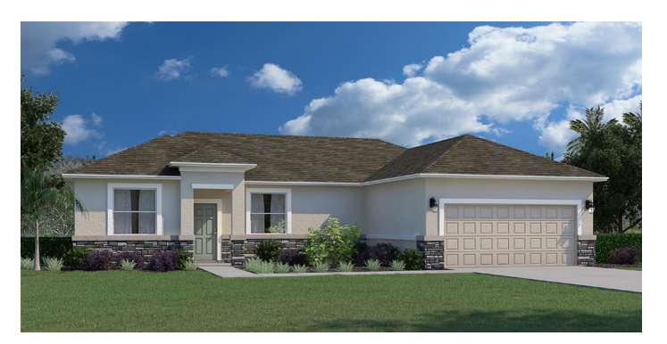
Architectural Style A - Stone