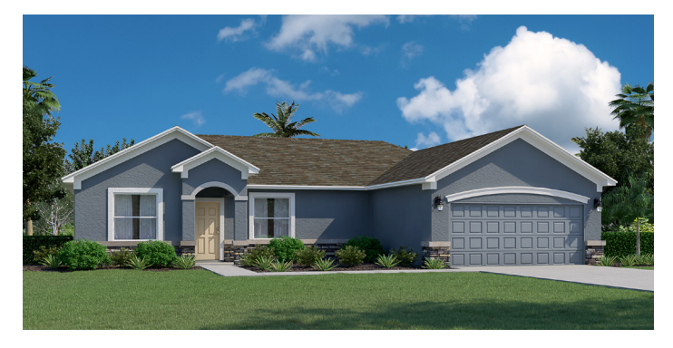
Architectural Style B - Stone