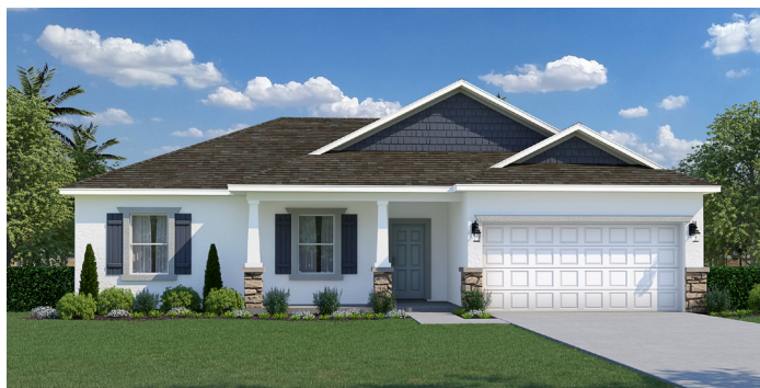
Architectural Style B - Stone