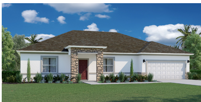
Architectural Style A - Stone