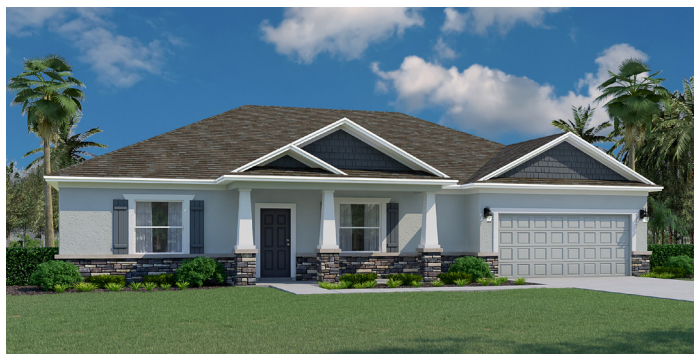
Architectural Style B - Stone