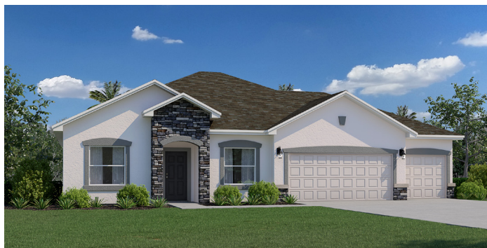
Architectural Style B - Stone