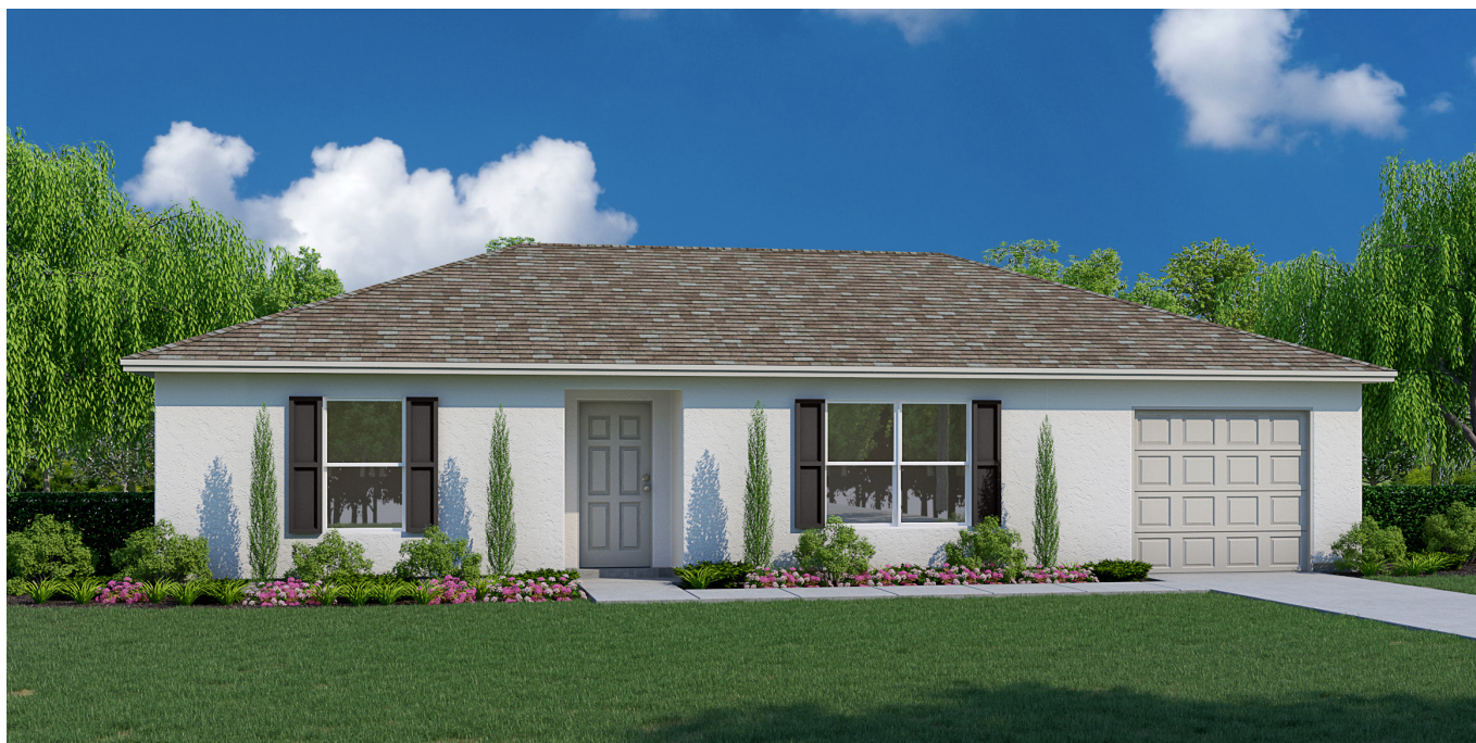
Architectural Style A