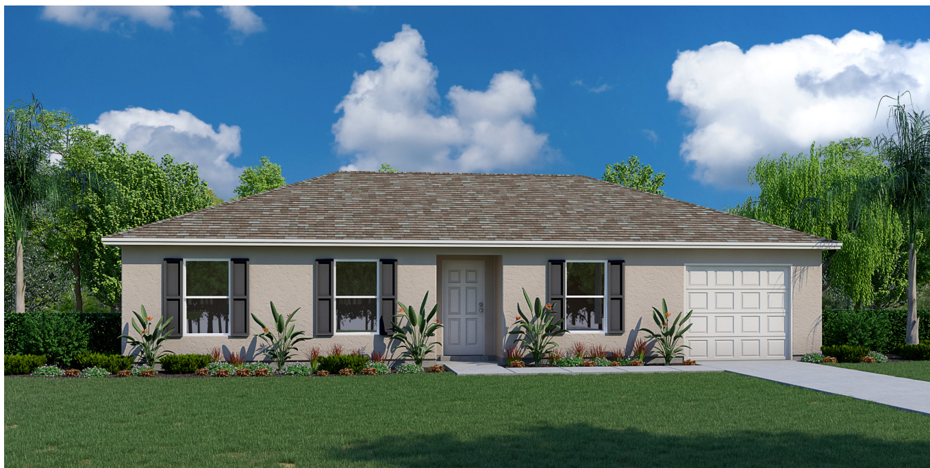
Architectural Style A