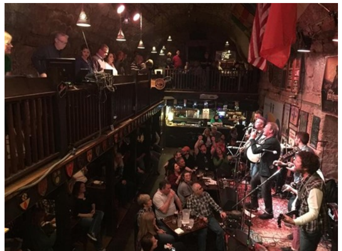
Weston Brewing & Irish Pub Weston, MO