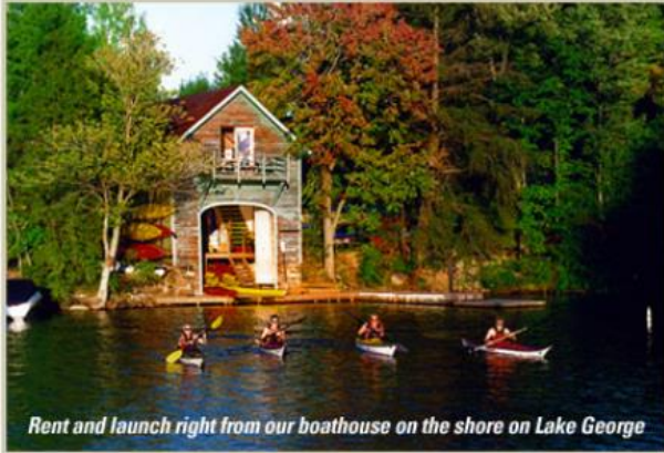
Rent and launch right from our boathouse on the shore on Lake George