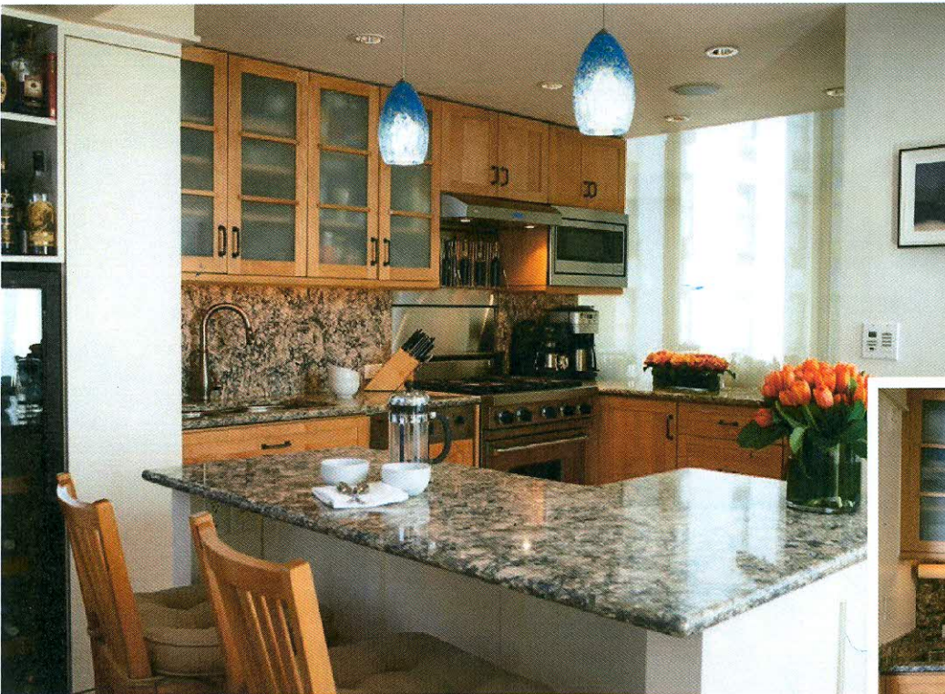
Solar shades on the windows keep the apartment from getting too hot or cold.