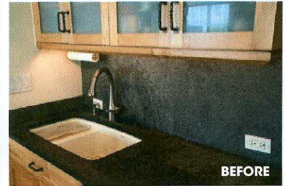
LEFT & BELOW: A light countertop, an inexpensive steel backsplash behind the range and a new sink and faucet brighten and update the kitchen.