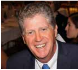
Governor Daniel McKee, Emeritus board member of the club, Honorary Chair of the Campaign

“The commitment we make today is going to make a big difference to the community. This [600 Social Street Building] use is far better, and it meets the needs of the community in a way that’s going to make it far better. This place helps kids reach their potential and that’s what makes the community stronger.”