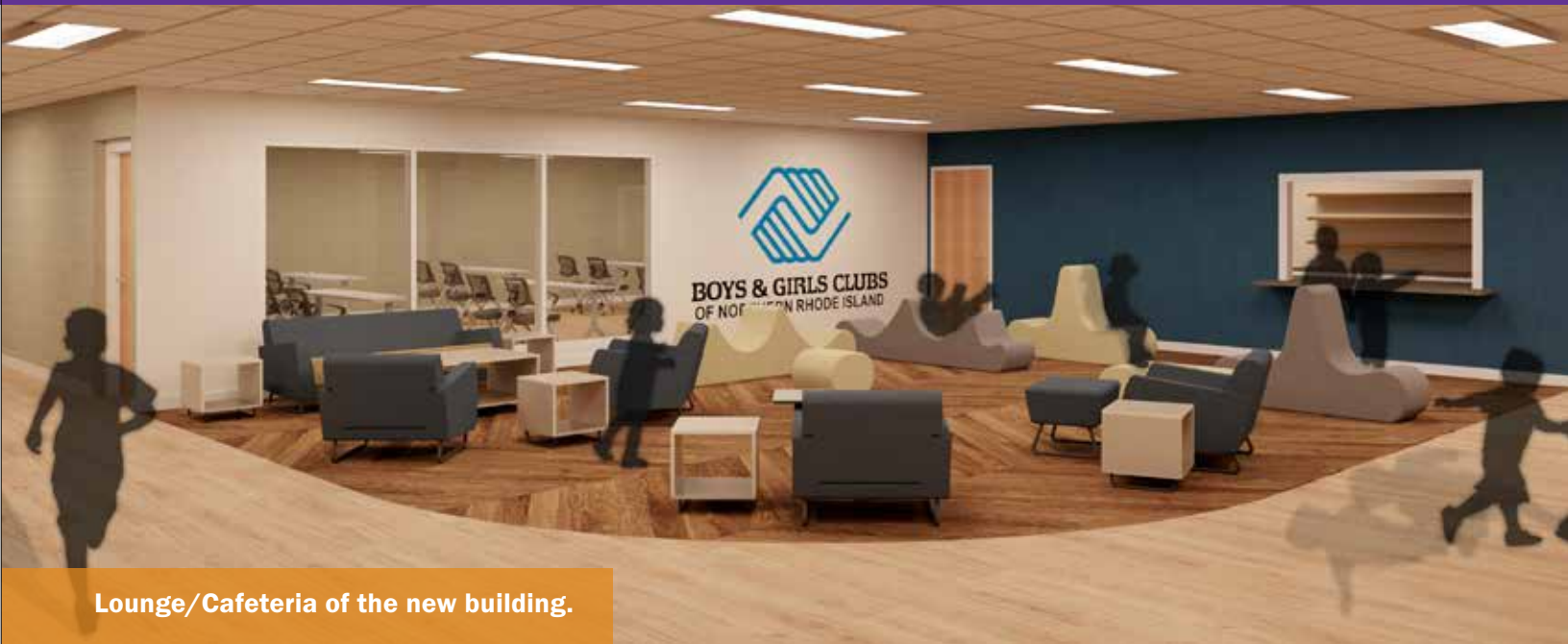
Lounge/Cafeteria of the new building.