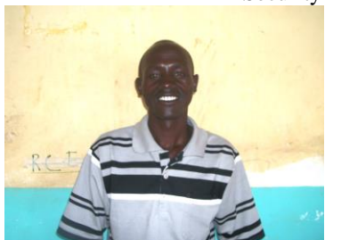
Solomon Dome -Poverty