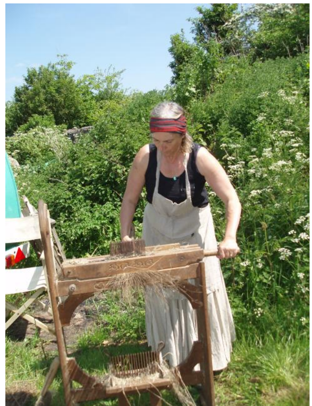
Breaking the rippled flax

First, the tops of the stems were 'rippled' by passing them through a coarse iron comb to remove the seed heads. Next came 'breaking', literally breaking the stems beneath a heavy oak lever to physically separate the fibre from the rest of the plant. The third step, 'scutching', used a specially designed paddle to beat these detached elements away from the fibre.