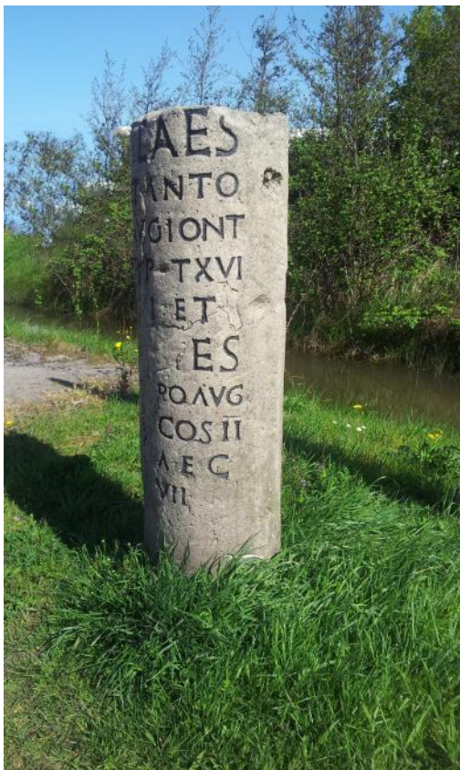
Roman milestone on the limes road near Valkenburg, South Holland