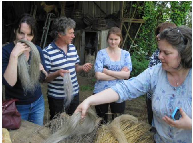
Comparing the distinctive smell of water-retted flax (left) with dew-retted flax (right)