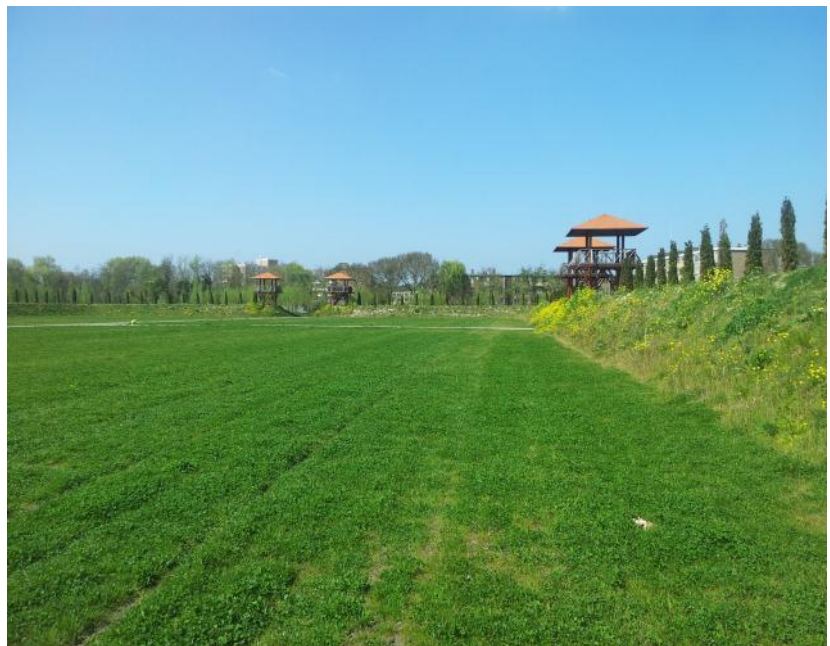
Reconstructed castellum at Archaeologisch Park Matilo near Roomburg, Leiden