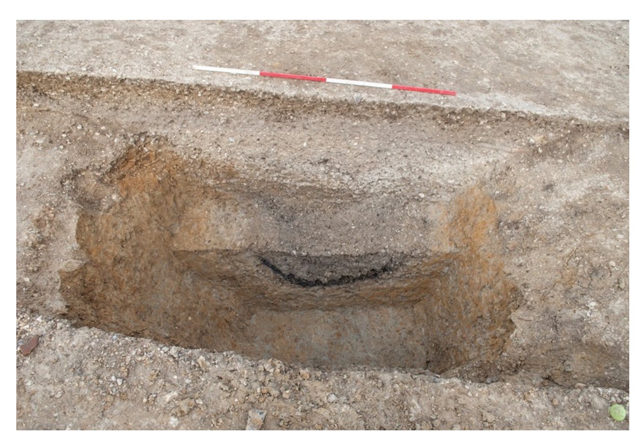
Charcoal Dump 2053 in Hillfort Ditch

this year to examine features possibly representing late prehistoric land division and agricultural layout, including the Silchester Dykes and a series of linear cropmarks and enclosures to the north east of Calleva , near Mortimer, we'll keep you posted on progress.