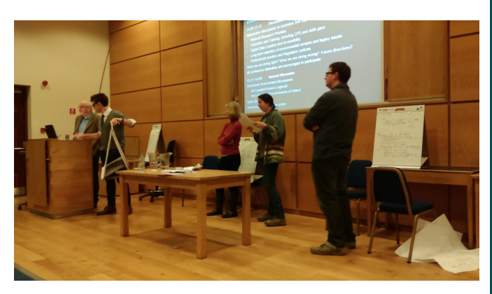
Group leaders present the 'big issues' from each of their break-out groups

We have good connectivity amongst the environmental community, and we are working with amazing material in Ireland, but there are challenges. We need to develop an advocacy strategy to attract the interest of colleagues in archaeology, funding bodies and the wider public. The importance of training the next generation was highlighted, and we should explore mentoring opportunities to assist the transition from student to professional. Much of our work is self-regulated, which may not be sustainable, and we need to work more closely with regulators. We should establish research frameworks that are workable and flexible. Robust national policies relating to the retention of environmental remains for future analyses must be developed. Finally, we