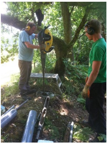
an old soil buried under a Coring the ramparts at Pond Farm

Neolithic to Bronze Age Activity and Clearance for Agriculture Evidence for the earliest local activity comes from a series of cores taken at the base of hill just above the floodplain to the east of the hillfort. Geoarchaeological description has revealed an old soil buried under a