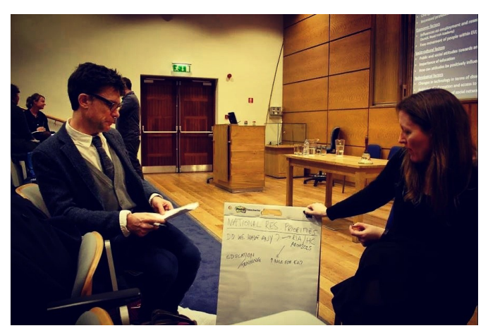
A break-out discussion group in action

During the morning session of the conference, a series of lectures highlighted exciting discoveries from recent years. Ireland is well known for its extraordinary wetland archaeology. Ellen OCarroll integrated analysis of wood, pollen and other remains from wetlands to provide a detailed understanding of past environments and societies. Scientific analyses of bog bodies enabled Isabella Mulhall to provide amazing insights into the personal stories of these people, including how they managed their appearance (some wore hair gel!), what they ate, and how they were treated in their final hours. Gill Plunkett also drew upon wetland and other archaeological evidence to investigate if we can measure