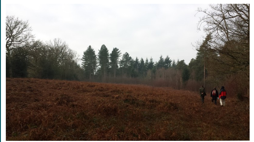
Pond Farm Hillfort Interior

We have approached a selection of these sites using fluxgate gradiometer, resistance and ground penetrating radar geophysical surveys (with 75ha of coverage achieved so far and plenty more planned), earthwork surveys and coring