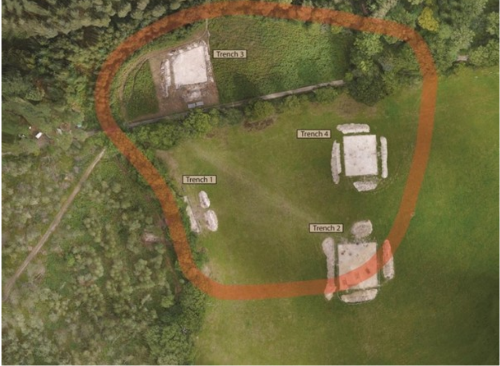
Kite Photo of the Pond Farm Hillfort Excavations

construction of the hillfort ditch and rampart would still have been a major undertaking in terms of time and labour. The defences are c.575m long and encircle an area of 2.1ha hectares. Three slots placed through the ditch in Trench 2 showed the cut to be up c.6m wide and c.2m in depth. The rampart still rises some 2.5m over the ditch today, coring indicates that local gravel was used to build it up in layers, with each dump compacted before laying the next. Potentially also topped with a fence, the ditch and rampart together would have formed a substantial boundary. Outside the main entrance is a second, smaller length of bank and ditch, clearly shown on the earthwork survey, which seems to have formed a further complex element of the entrance, restricting the size and direction of approach and further adding to the impressive nature of the monument.