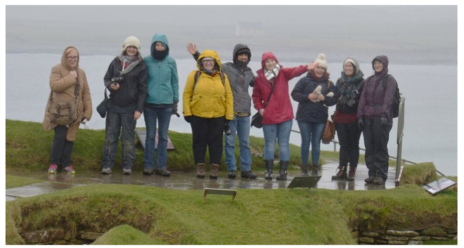
A sheltered (?) spot at Skara Brae

The evening reception at Stromness Museum was a definite success, the museum is a small gem of a place, devoted to Orcadian natural history, the maritime travels and explorations of Orcadians. As an Australian, I was intrigued to discover that Captain Cook's ship Resolution had stopped in Stromness on its way home after his fatal final voyage. Certainly fulfils its mission statement: 'to promote natural science, to preserve local history and to offer an enjoyable educational and informative experience to as large a range of people as possible'. A fine end to a day full of stimulation.