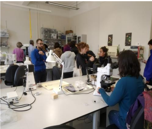
Tour of the Liverpool Archaeobotany lab

A new innovation at this conference was the use of lecture capture technology to record oral presentations, with the intention of providing a digital depository of select conference presentations on a dedicated website once various IPR issues are resolved. The anthraco2019 proceedings will be published next year as a 3-part peer-reviewed special issue in Quaternary International .