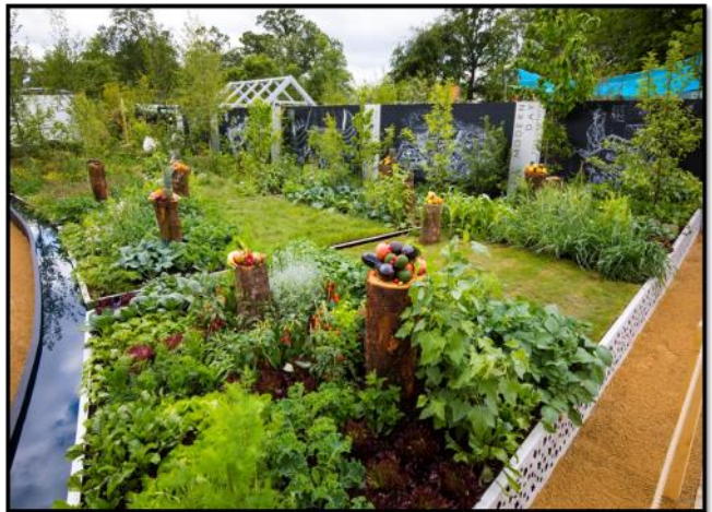
Meriel McClatchie: "Development of a Bloom show garden in 2019 enabled research from the UCD Archaeobotany Laboratory to move beyond the academic sphere to the public domain. More than 115,000 Bloom visitors learned the hidden history of what we ate in Ireland over the past 8000 years, based upon archaeobotanical evidence."