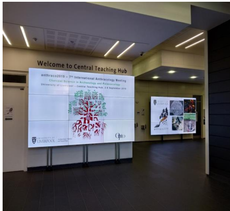
Anthraco2019 reception area at the University of Liverpool Central Teaching Hub