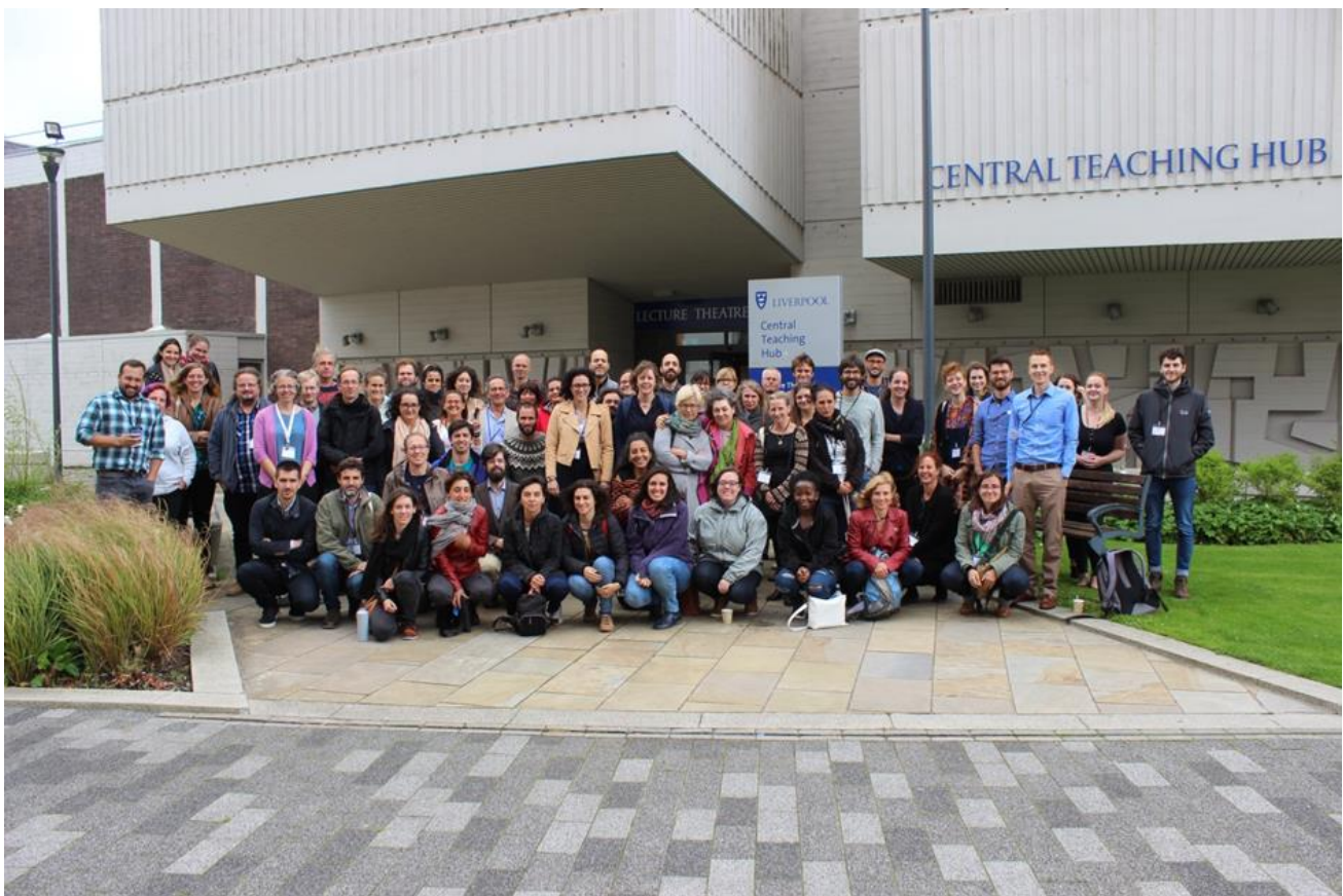
Anthraco2019 delegates at the entrance of the conference venue (University of Liverpool Central Teaching Hub)

The 7 th International Anthracology Conference took place at the University of Liverpool's award-winning Central Teaching Hub – designed around a central atrium, it is a bright light-filled space, with multi-functional zones – a wonderful setting for this important conference (usually held once every 4 years), specifically promoting the dissemination and discussion of all things charcoal. It was a truly international conference, with more than 80 delegates from a wide range of European countries, the Americas, Asia and Africa.