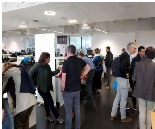
Tour of the Environmental Sciences lab in the Central Teaching Hub