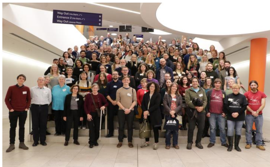
Delegates at the AEA's 40th Anniversary Conference in Sheffield