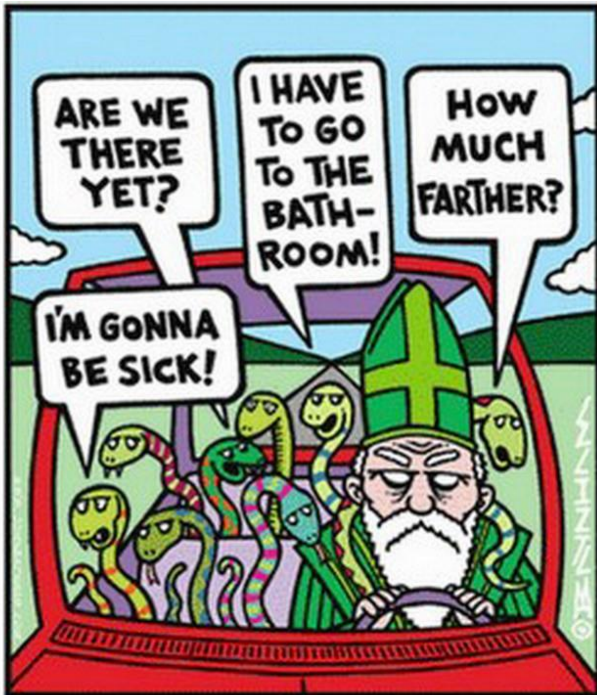
St. Patrick driving the snakes out of Ireland.