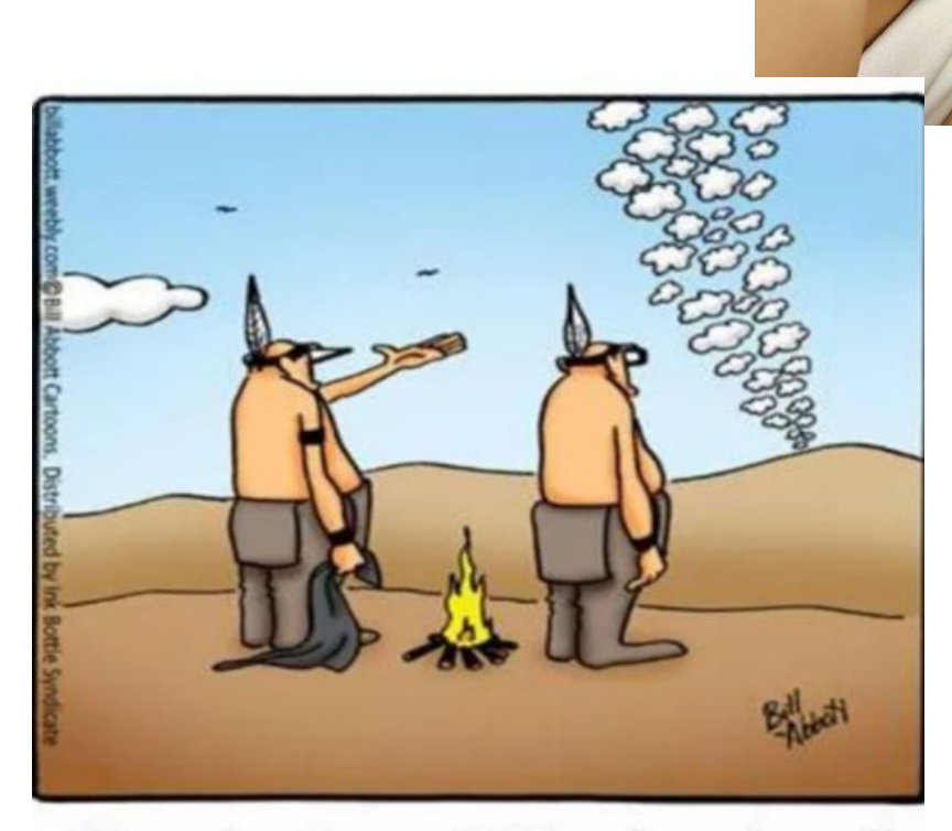
"See what I mean? Why does she call me when she won't let me get a word in edgewise?"