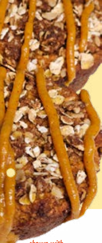
shown with carrot cake spread, p 15