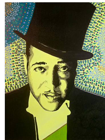
Duke Ellington Mixed Media, 24x20 $3,450