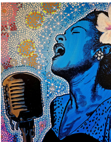
Billie Holiday Mixed Media 24x20 $4,550