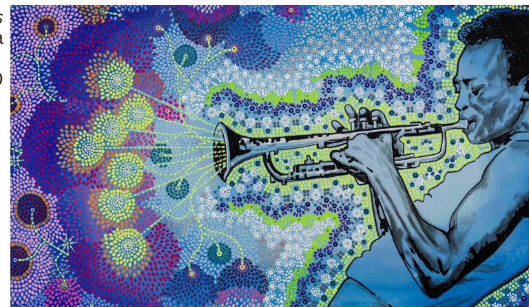
Miles Davis Mixed Media 24x48 $7,150

Artwork can be purchased through the Sarasota Orchestra Ticket Sales Office.