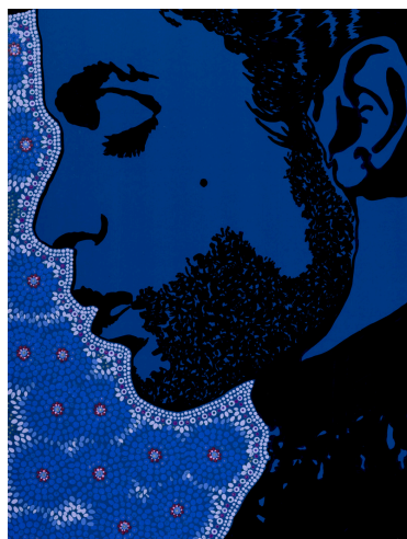
Prince Mixed Media, 30 X 20 $2,405