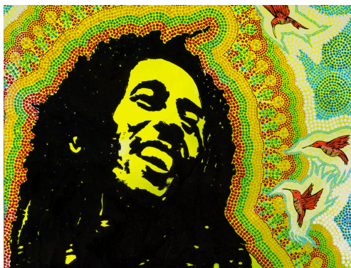
Bob Marley (Frequency of Love) Mixed Media, 36x36 $9,750