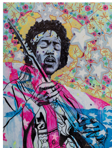
Jimi Hendrix Mixed Media, 48x36 $13,650