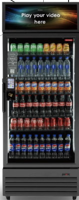
AI VENDING MAX 620S