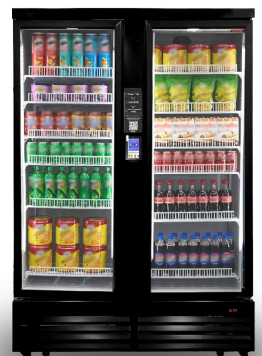
AI VENDING ULTRA