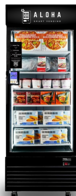
AI VENDING FROZEN