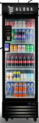
AI VENDING MINI