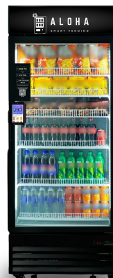
AI VENDING MAX