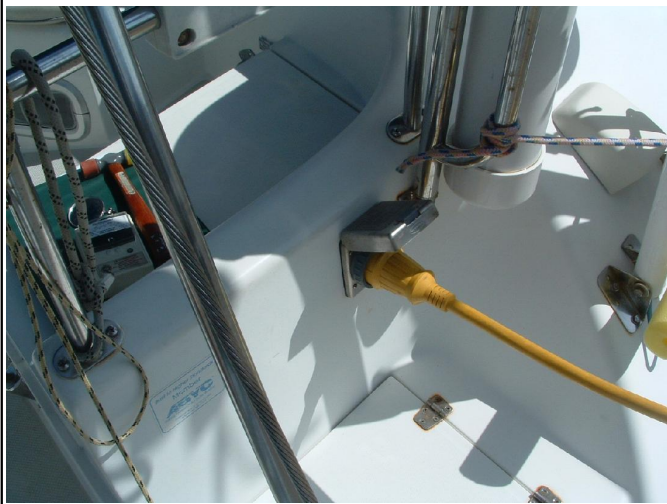
Shore Power Inlet