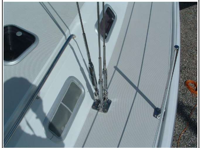
Starboard Chain Plate