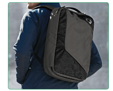
SHOULDER BAG CONVERTS TO A BACKPACK