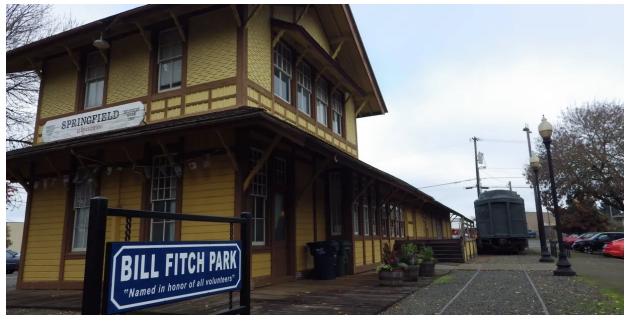
Springfield Station, 101 South A Street Springfield, Oregon