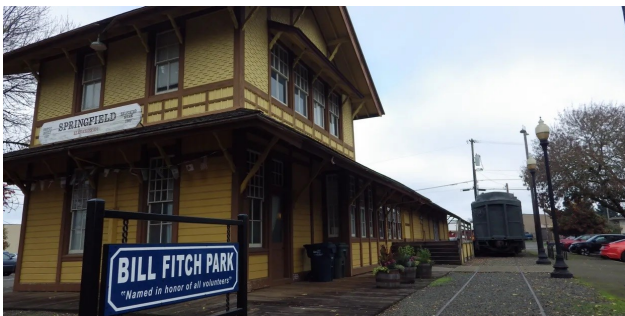
Springfield Station, 101 South A Street Springfield, Oregon

Where? We Meet at the Springfield Depot Freight Room