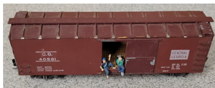
Blaze Lyn- Styl